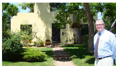
INSIDE: Santa Fe style